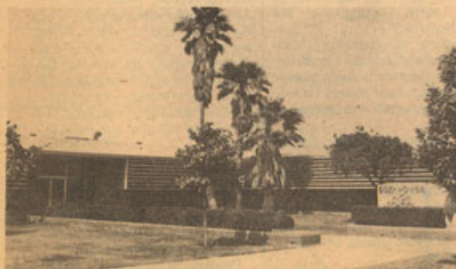
LIKE IT USED TO BE. Ike's original administration building.

'Memories may be beautiful... or much too painful to remember'