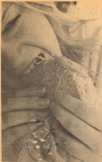
A HUNGRY Eagle sinks her teeth into a taste tempting taco.