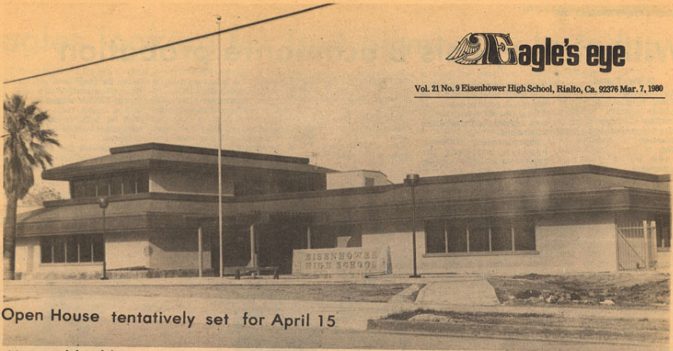
Open House tentatively set for April 15