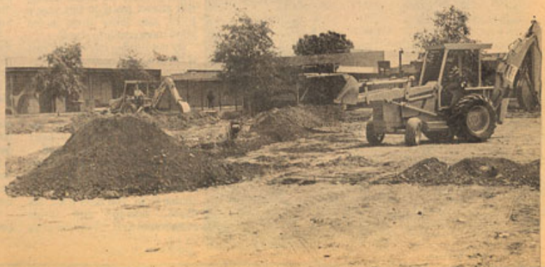
STARTING OVER. Bulldozers clear the way.