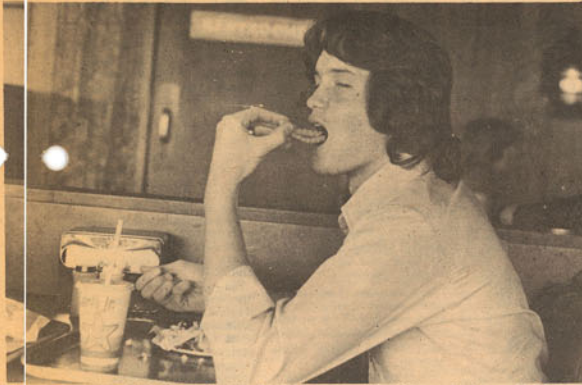
"HAVEN...I'M IN HEAVEN," thats what this Ike student seems to be thinking as he devours his fries.

This was the second best taco we found, almost as authentic as El Burrito's but not quite as seasoned. This shell was also home-fried and the cheese and lettuce was fresh and sharp.