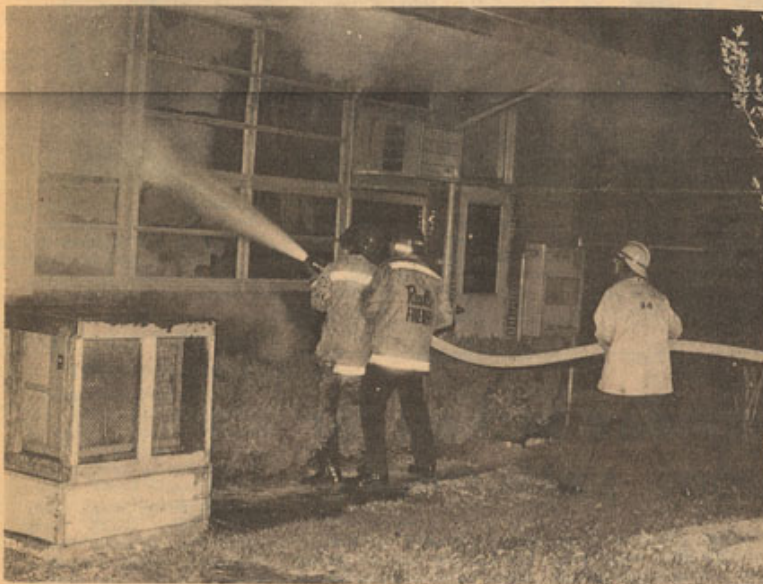
THANKSGIVING NIGHT, 1977. Firemen extinguish flame set by juvenile arsonists.