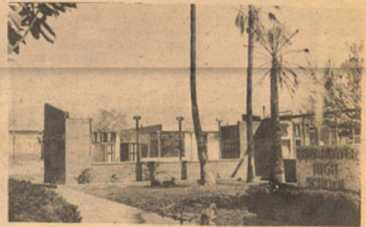
SKELETON REMAINS for over a year.