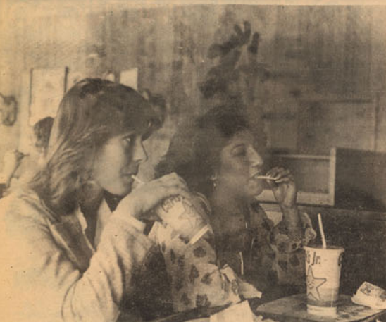
THESE IKE STUDENTS don't look like they're too interested in lunch...maybe they're contemplating that hot date coming up.